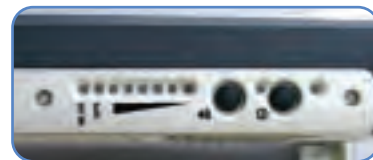
Front view, close-up